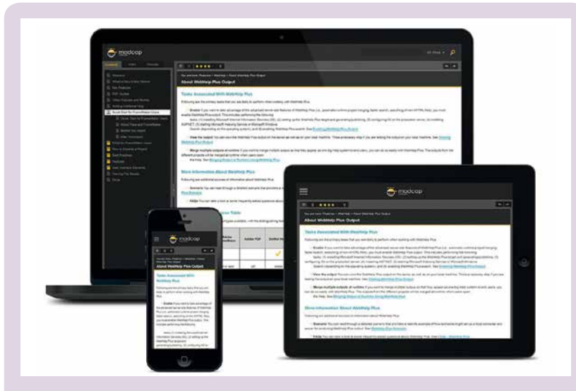
Figure 1. Responsive output on different size screens