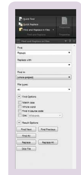
Figure 3. New Find and Replace

I have always been a fan of Flare, and I think that Flare V10 is a leap forward in terms of functionality and improved output for our customers and the users of our help systems. Responsive output and support for OpenType fonts are two excellent features that make this release a 'must upgrade' in my book.