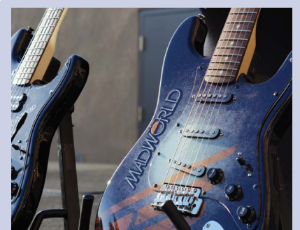
Figure 3. Most coveted MadWorld door prizes included two one-of-a-kind guitars