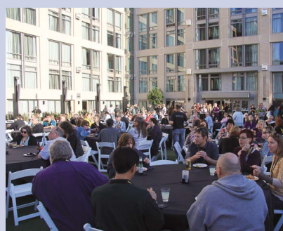
Figure 2. Sunshine, free drinks and terrific door prizes provide a happy ending to a fabulous event