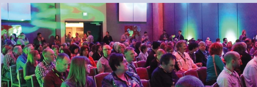
Figure 4. Comedian Wayne Cotter captivated a full-house