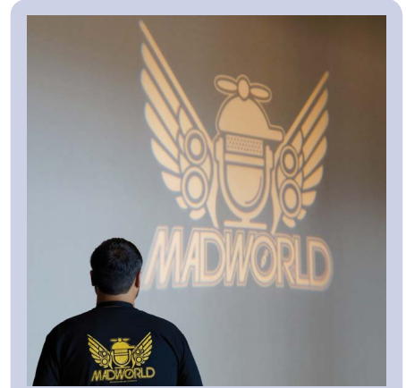
Figure 5. Madworld logo in hotel lobby

Whether it is responding to an email, answering a phone call, or talking to you at an event, MadCap staff has a talent for making you feel like you are the only person that matters. If you aren’t already hooked on Flare , a few