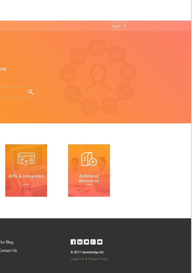
cleverbridge's Client Support Center, Created with MadCap Flare