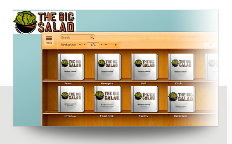
The Big Salad Bookcase

The Big Salad Intranet is an HTML5-based website that employees can use as a reference for any of their needs. It is privilege-protected, granting access to specific content based on the user's role—from corporate employee to franchise owner to franchise employee.