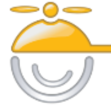
Image Positioned Right. Here is some general text for a topic. Replace this with your own content. Here is some general text for a topic. Replace this with your ...

Your search for "Table" returned 3 result(s).